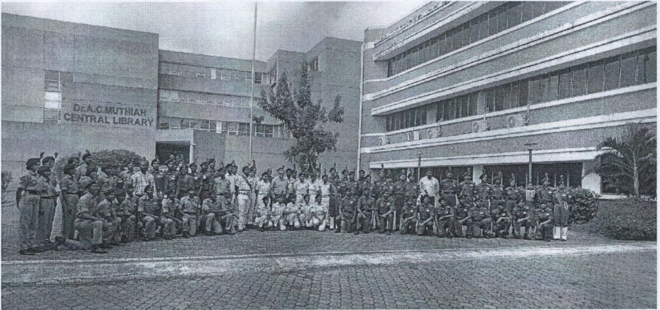
Fig. 5. Group Photo along with Principal, NCC Officers and Cadets.