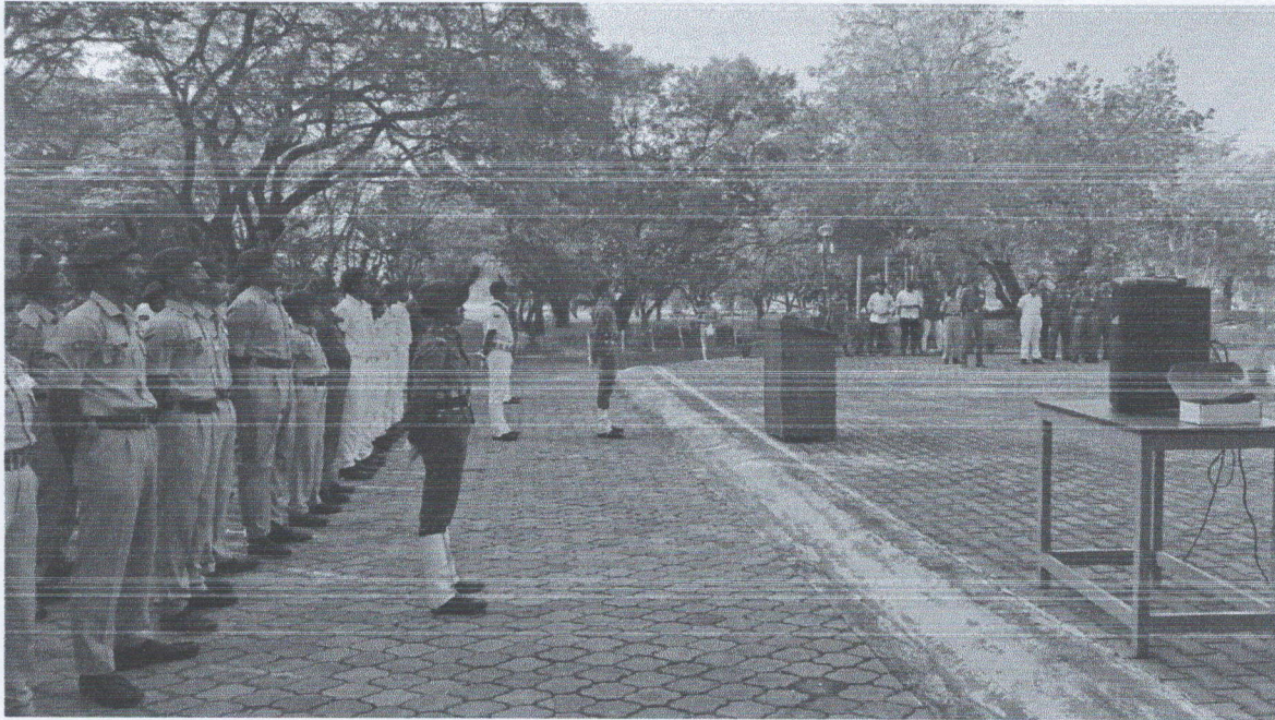
Fig. 1. NCC Cadets are assembled for the Republic Day celebration.