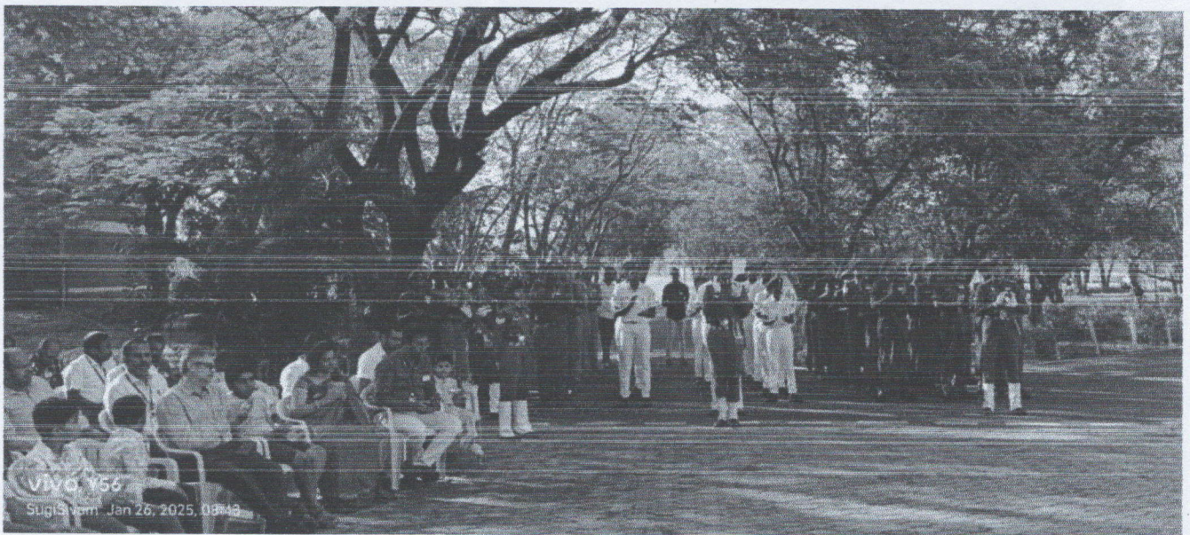
Fig. 4. The NCC cadets are performed cultural programs.