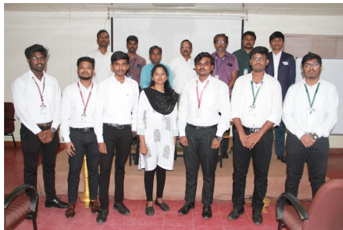
Office Bearers of AAE & SAE for the academic year 2024-25

The newly elected AAE and SAE Office Bearers for the academic year 2024-25 were introduced to the gathering. Their responsibilities and objectives were outlined, encouraging them to take initiative and actively lead association activities.