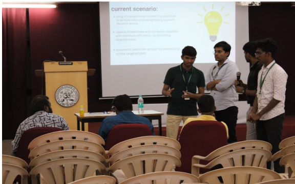
Track 3- Innowel: