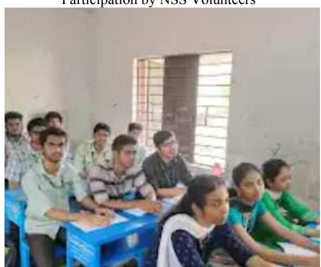
Participation by NSS Volunteers