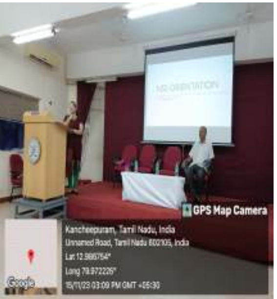
Addressed by the Chief Guest