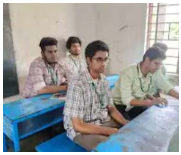
Participation by NSS Volunteers