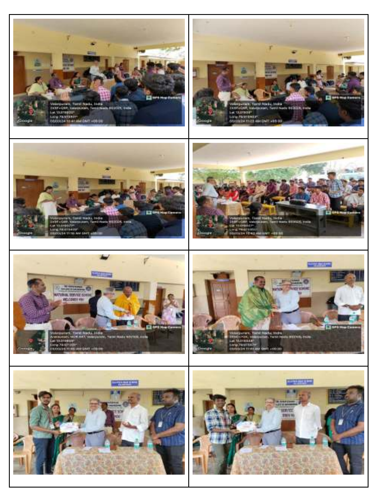
Day 7: Valedictory function and certificate distribution by Principal SVCE