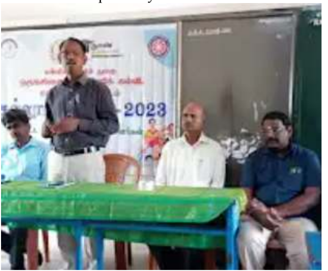
Addressed by Chief Guest