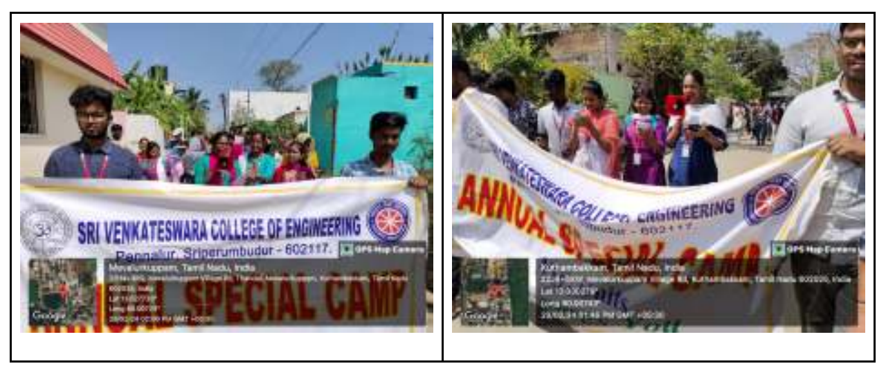
Day 4 (29/02/2024): Yoga session and Awareness Rally near the surroundings of Mevalurkuppam.