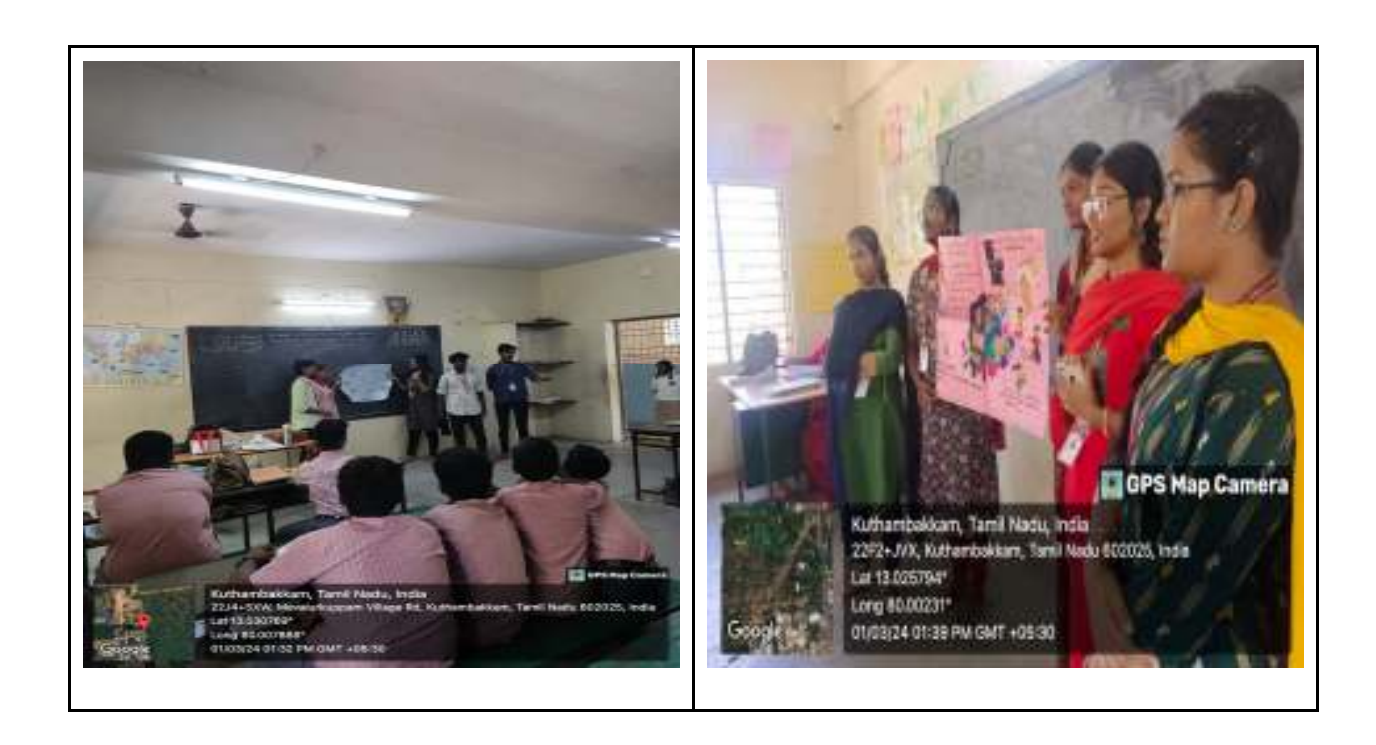
Day 5 (01/03/2024): Expert awareness on usage of Fire extinguisher and Interaction with school students on water conservation and hand washing(using charts)