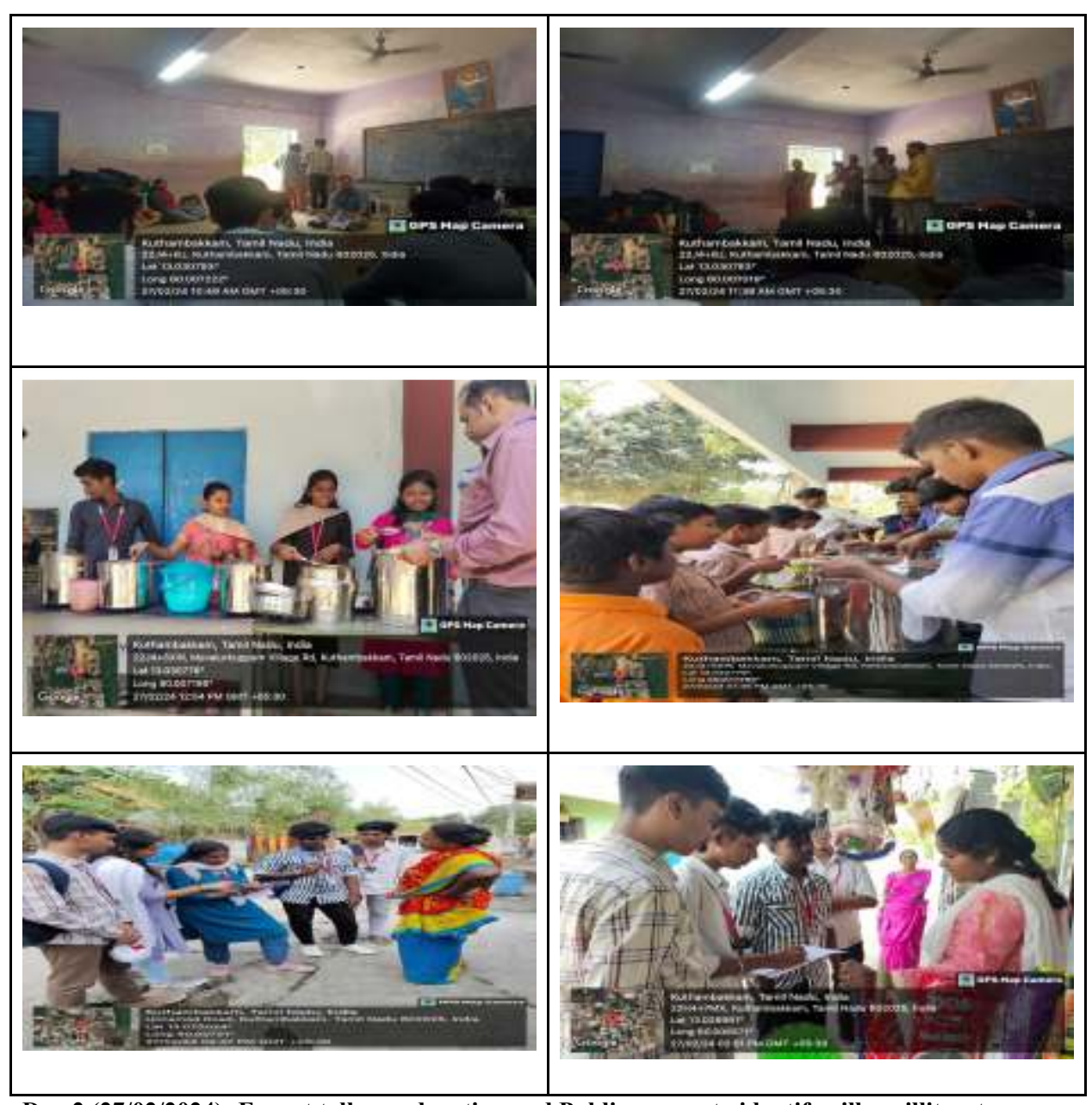
Day 2 (27/02/2024): Expert talk on education and Public survey to identify village illiterates