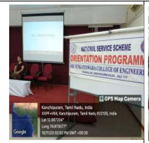
Inauguration of Orientation Programme