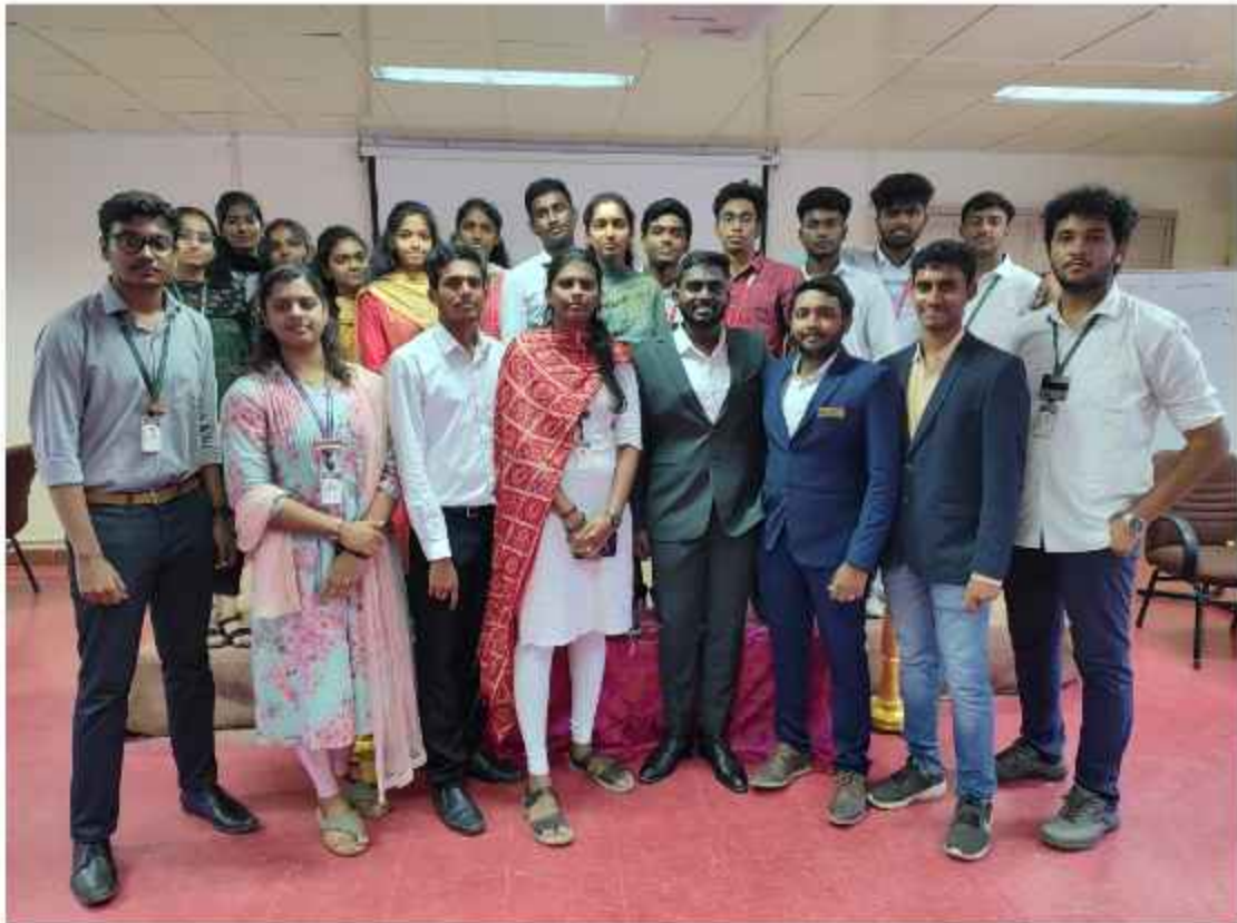
Office bearers of ECEA, IETE-SF, RAIC of the academic year 2023-24