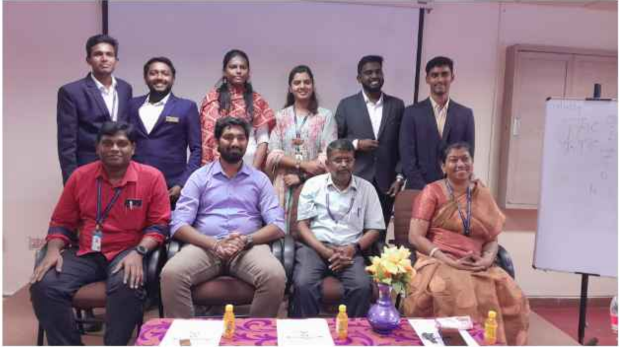
Senior Office Bearers with the Chief Guest, the HOD and the faculty coordinators