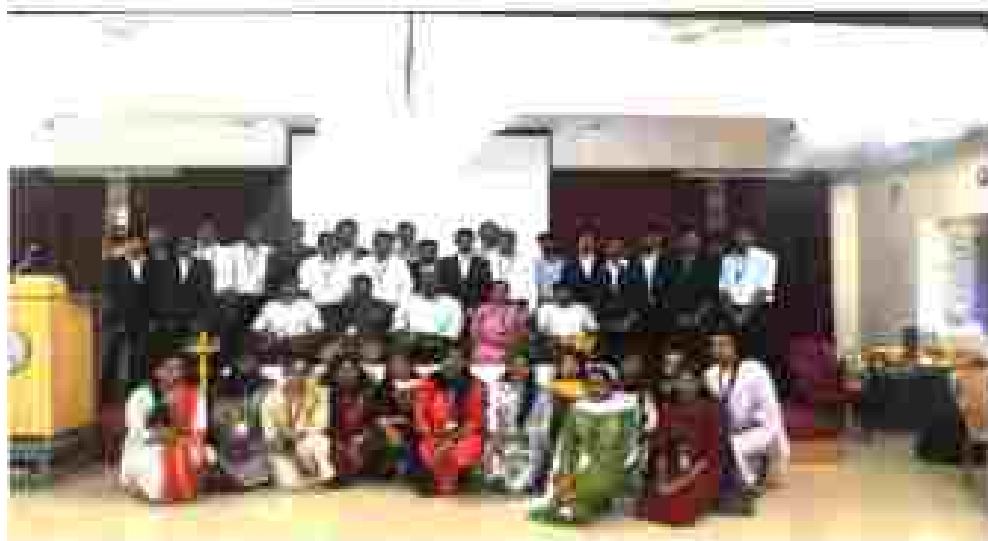
Office Bearers of the Club