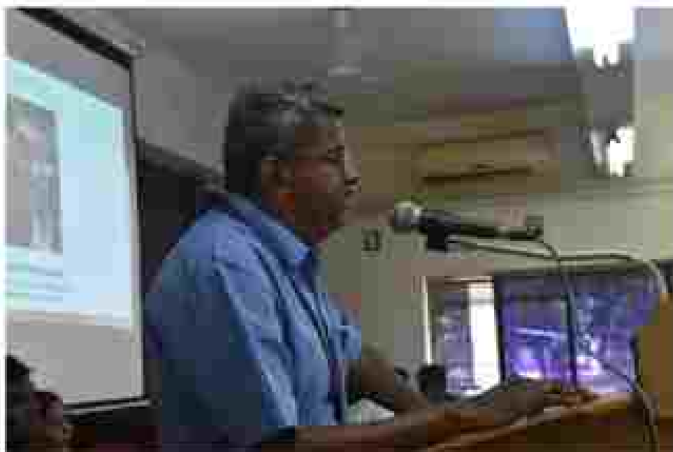
Speech by Head of the Department