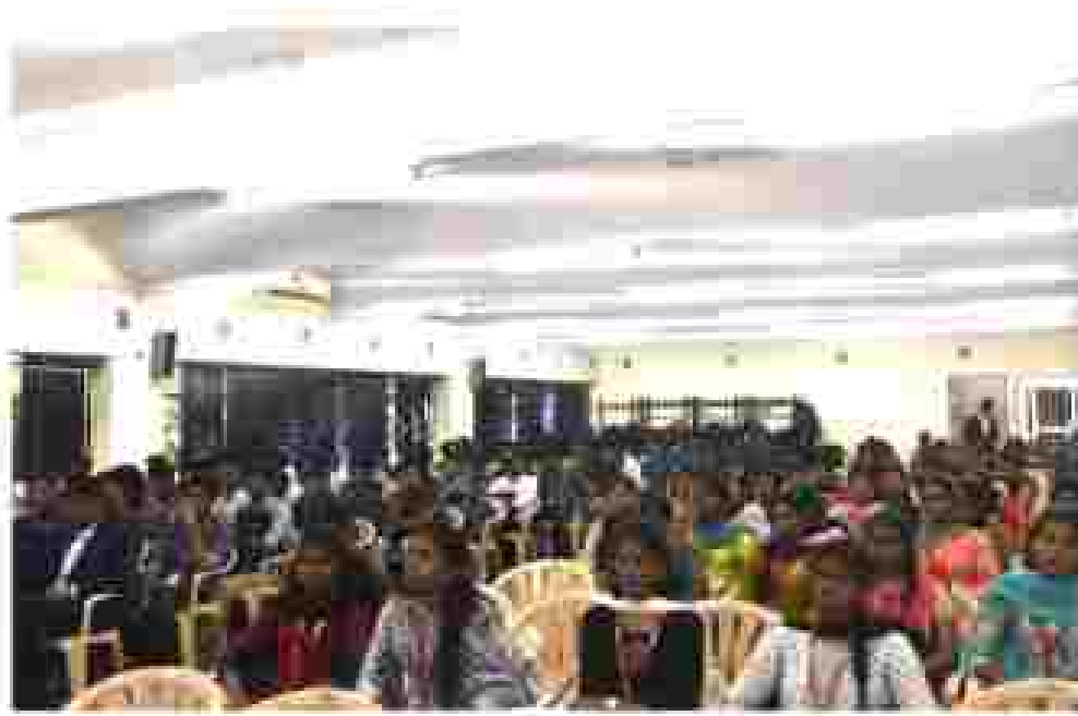
Audience of the Event