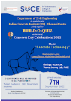
Brochure - BUILD-O-QUIZ.png 1598K

Assistant Professor - Civil Department, Sri Venkateswara College of Engineering, Sriperumbudur