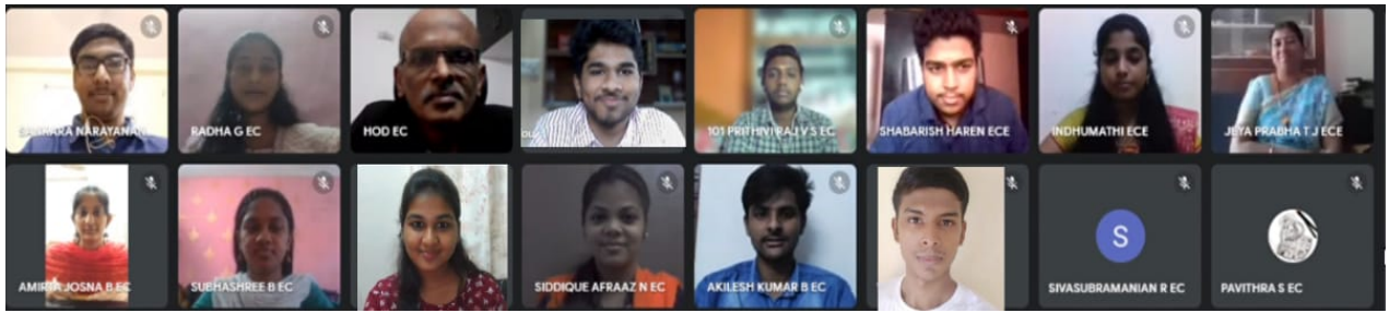
OFFICE BEARERS OF ECEA 2021-2022