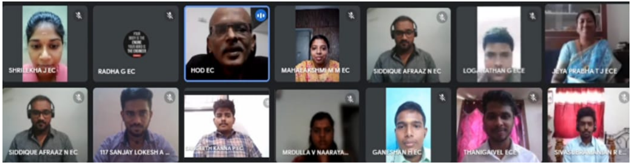
OFFICE BEARERS OF IETE SF SVCE 2021-2022