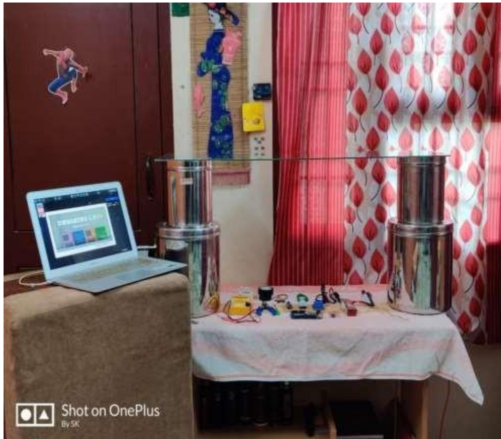
(Preparation and Setting of the project before event )

The speaker started with a short introduction about the projects done by him in various domains like IOT, Embedded Systems and shared how he ended up with the idea of this project. The project constituted of the automation of his room with the help of microcontrollers and sensors. The speaker showed all the components that were used in the project and threw light on the concepts like “Why the components were used” and “What more can be done using them”. The event was made more informative and interesting by fun facts included then and there. The automation was live telecasted wherein the participants visualized the working of the project and every small details were illustrated and the doubts were clarified instantly.