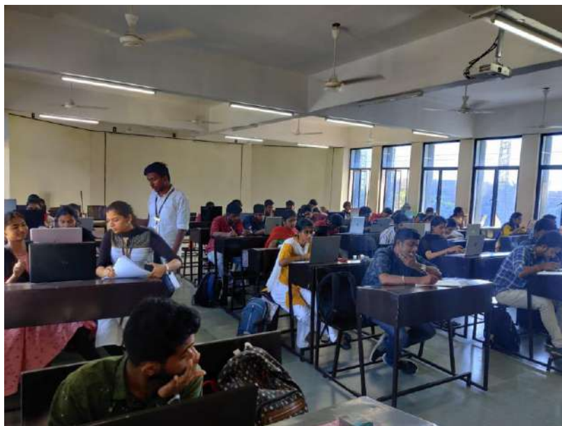
(Students attending the assessment Test)