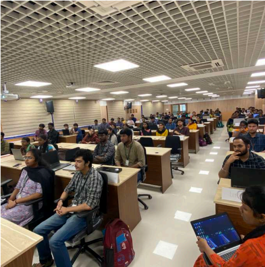
(Participating teams in their respective workspaces)