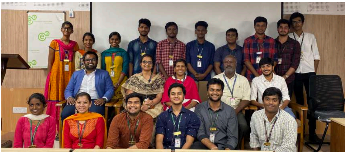
(Organising team with the Chief Guests)

The organising/mentor team were also praised by the Chief Guests for planning and executing an event like this in such a very short time period and bringing out the best in the teams taking part.