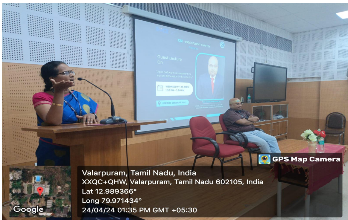
HoD giving short note on guest lecture