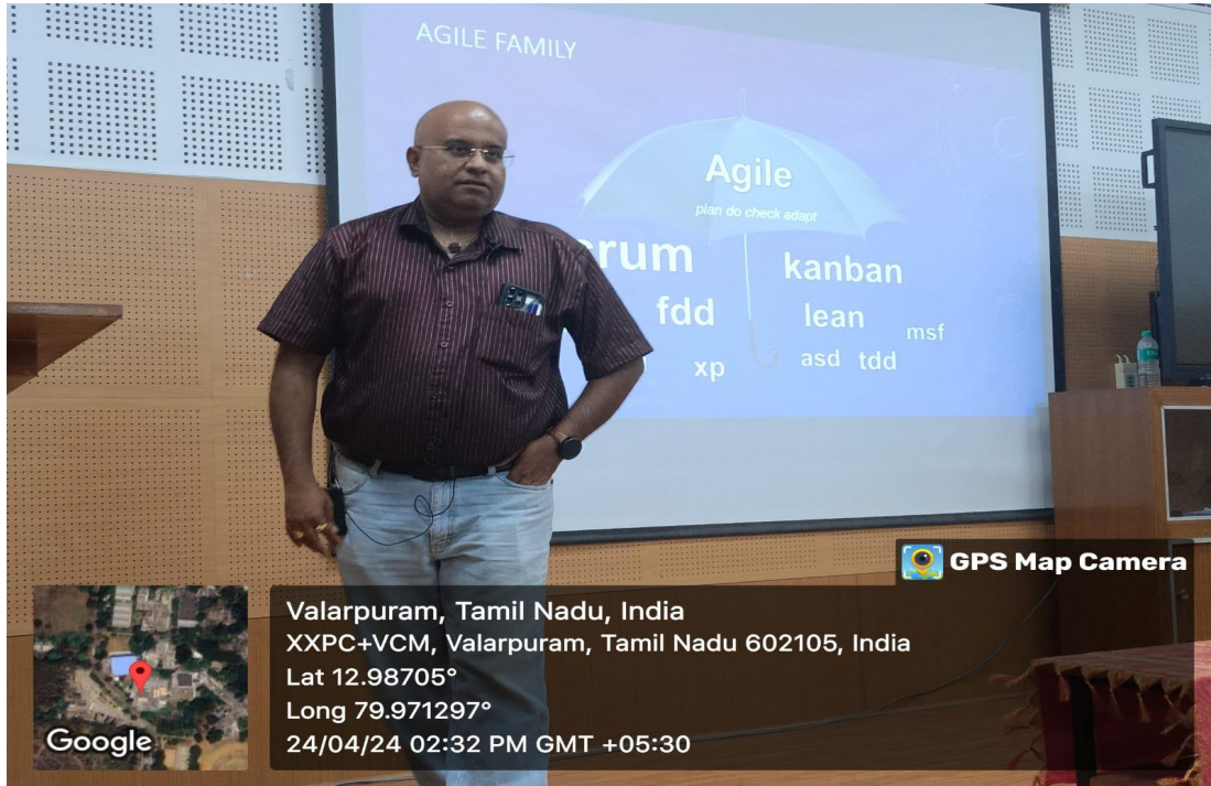
Guest Lecture by chief guest