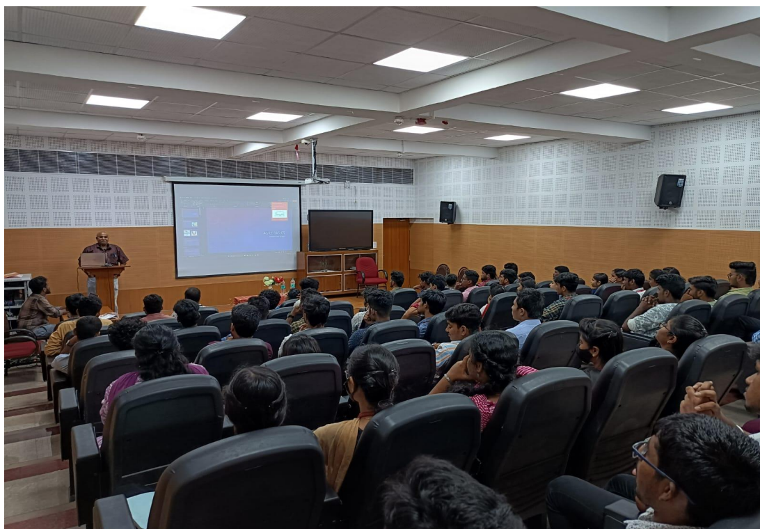
Students interacting with the chief guest