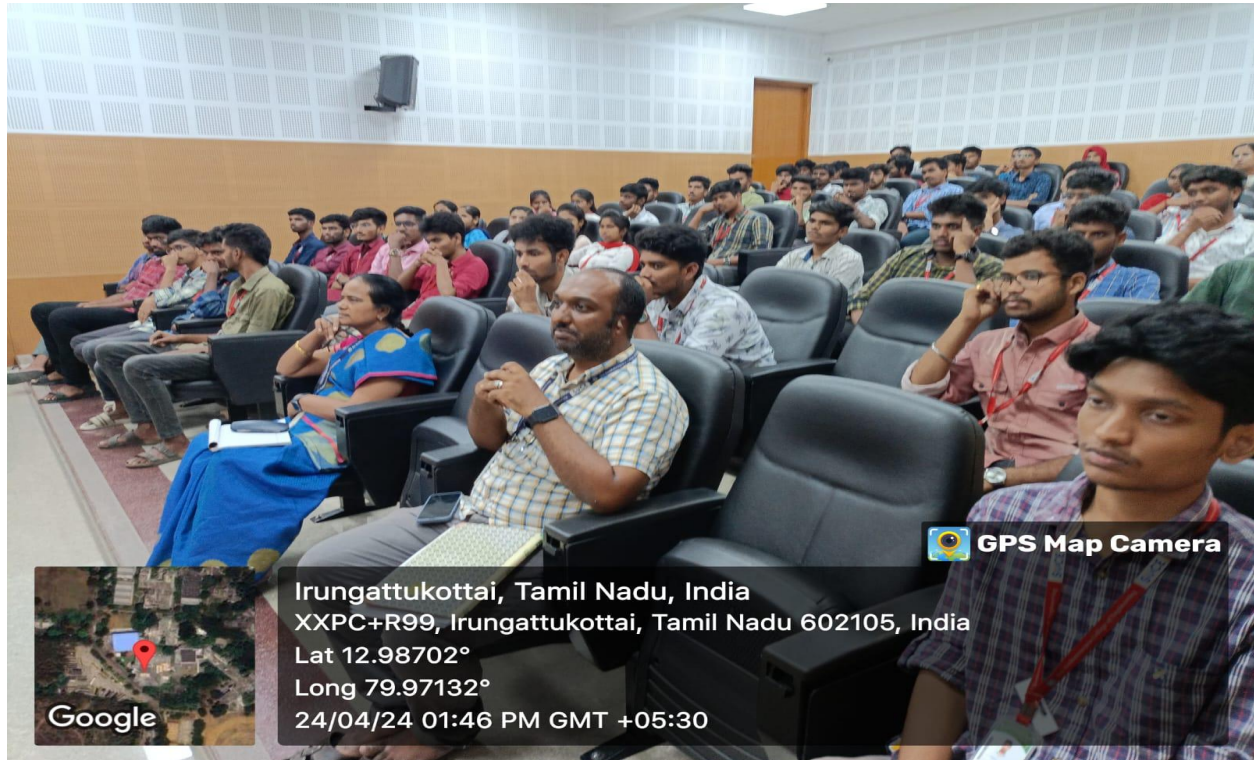
Students in the venue for the event