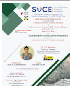
Guest Lecture on Sustainable Construction Materials.png 2216K