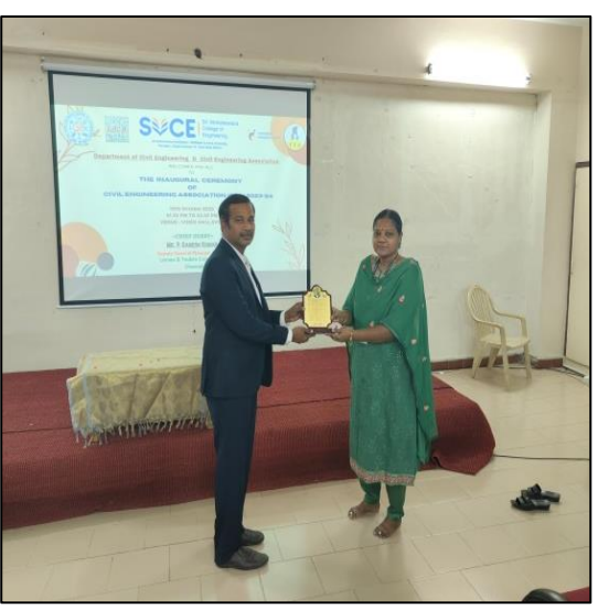
Felicitation of Chief Guest with Memento