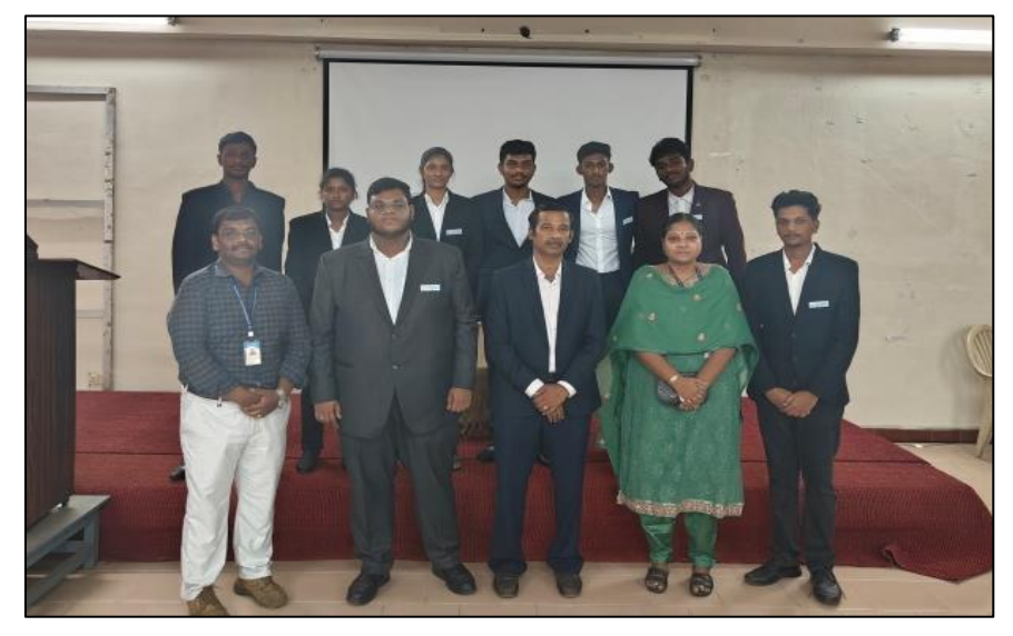
Photograph with Chief Guest, Head of the Department, CEA Faculty Coordinator and CEA Office Bearers