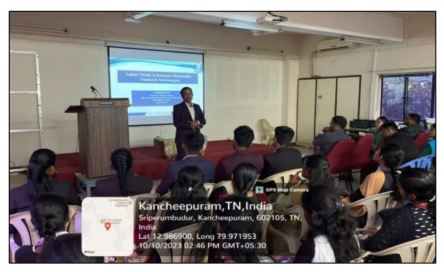
Interactive Session with the Students of Civil Engineering