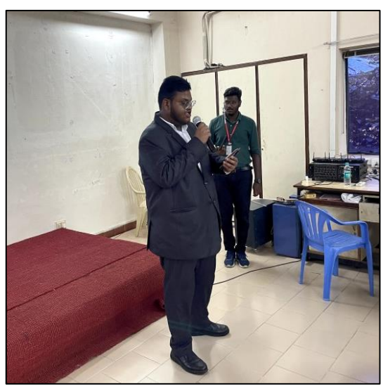
Introduction of Chief Guest by the President of CEA