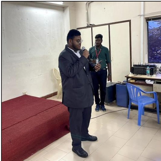
Introduction of Chief Guest by the President of CEA