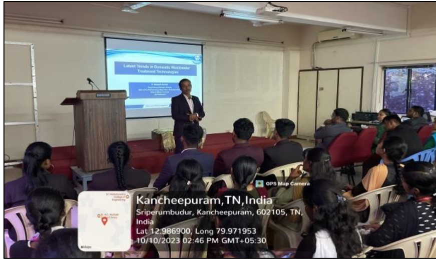
Interactive Session with the Students of Civil Engineering