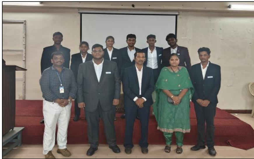
Photograph with Chief Guest, Head of the Department, CEA Faculty Coordinator and CEA Office Bearers