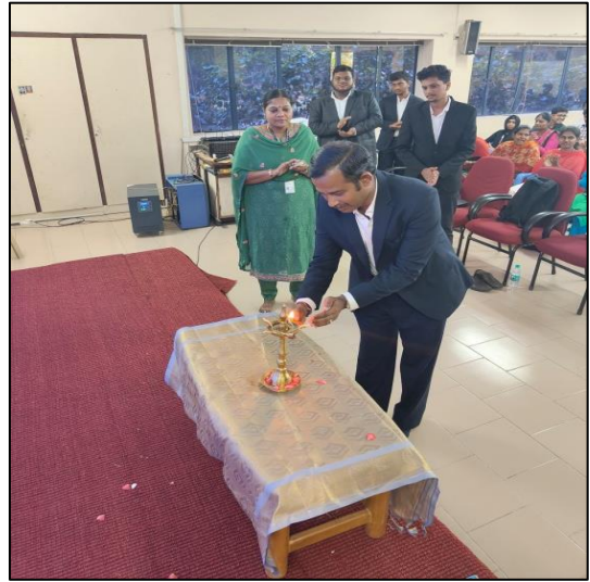
Lightening of "Kuthu Vilaku" by Chief Guest