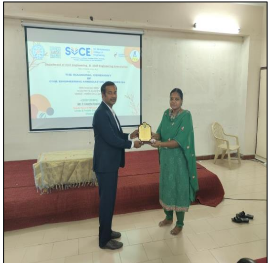
Felicitation of Chief Guest with Memento