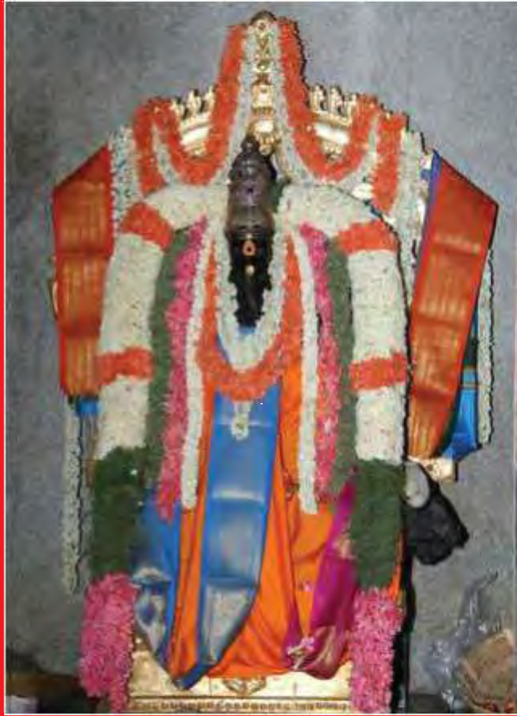
Sri Vijaya Ganapathy (Campus Deity)